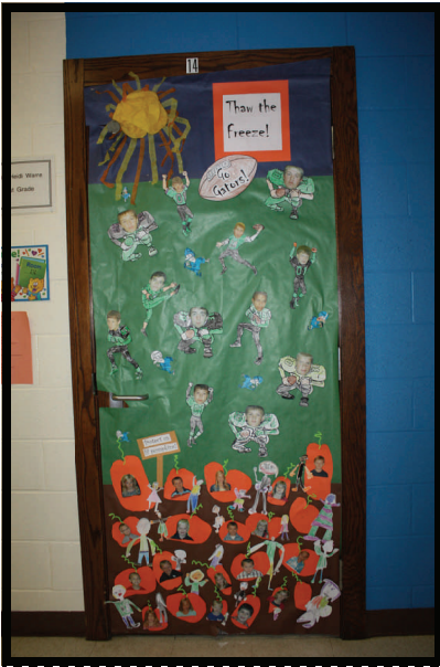
GRADE 1 winner